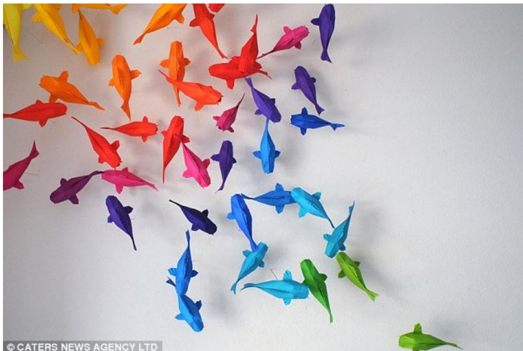
Colourful cascade of carp descend across a white backdrop

Read more: http://www.dailymail.co.uk/news/article-1217194/Origami-master-Sipho-Mabona-art-creating-paper-butterfly.html#ixzz2Y4nxDWj5